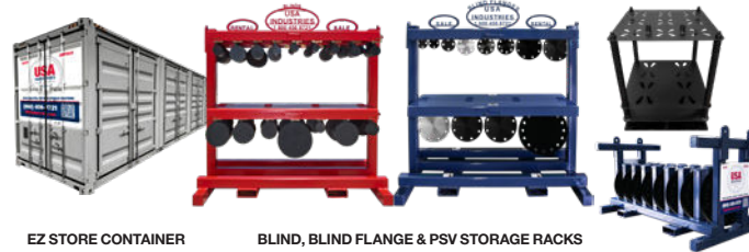
EZ STORE CONTAINER