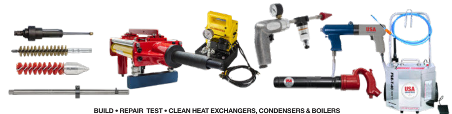
BUILD • REPAIR TEST • CLEAN HEAT EXCHANGERS, CONDENSERS & BOILERS