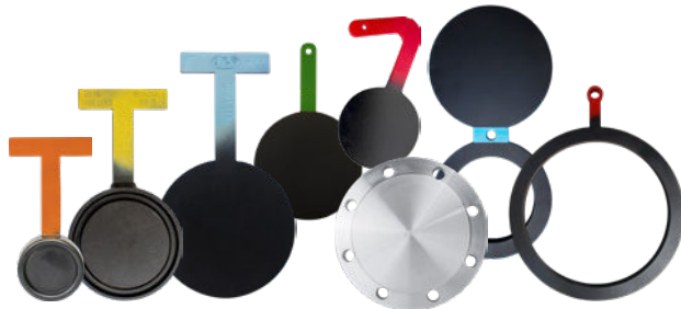
ISOLATION, HYDRO & CUSTOM THICKNESS BLINDS & BLIND FLANGES