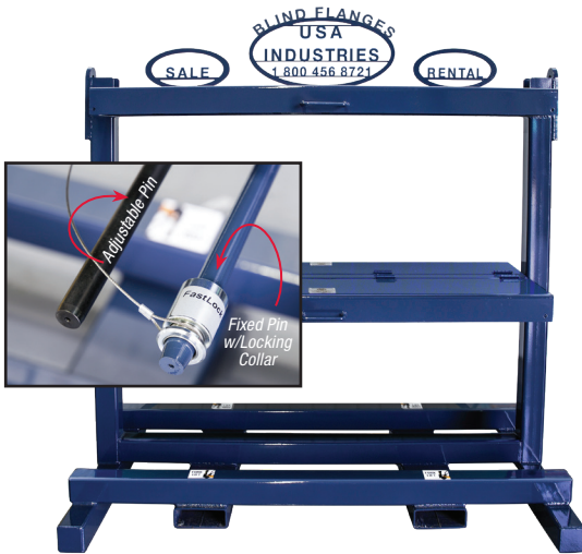
Locking Blind Flange Rack Storage Solution

For industrial plants, managing the storage, transportation, and minimizing loss of numerous blind flanges has always posed challenges. USA Industries stands out as the Best in Class choice for purchasing and renting blind flanges across various piping sizes. Now, we introduce a comprehensive storage solution for your site inventory of blind flanges. EZ Store Blind Flange Racks aim to provide active job sites with a stable and organized storage solution for rented or purchased inventories before, during, and after turnarounds, maintenance jobs, or projects.