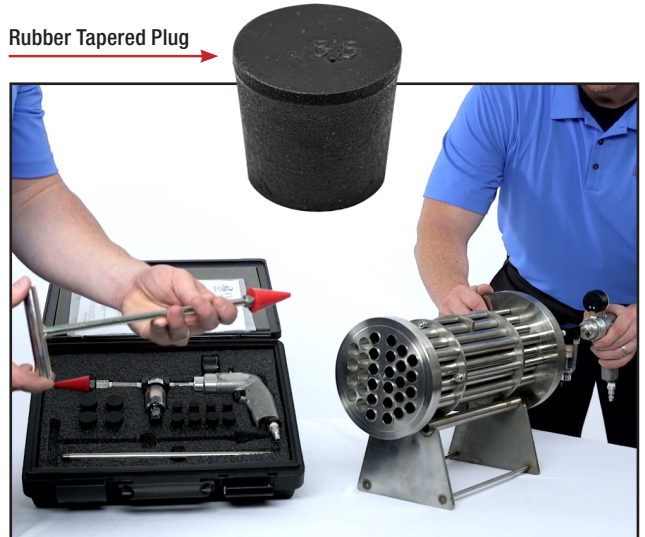
Rubber Tapered Plug

Seal the far-end of the suspect tube(s) using either a Rubber Tapered tube plug or the “T” Handle tool provided in the VLD Kit, designed for the specific tube O.D. and gauge.